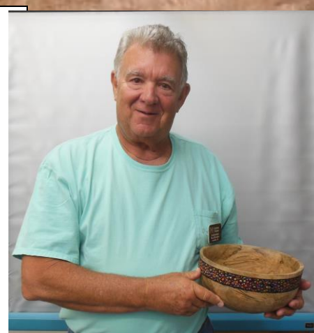
June Mystery Winner